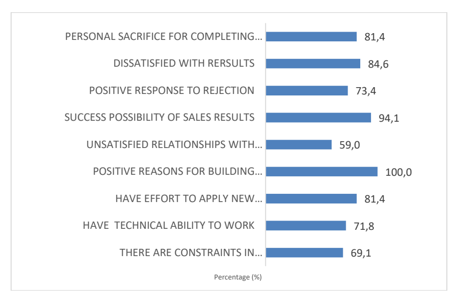
Graph 3. Characteristics of SME competitive behavior

The characteristics of SME competitive behavior are determined by accountability, drive to win, and technical expertise. In terms of accountability, it was found that personal sacrifice for completing work is low and there is dissatisfaction with the results. Drive to win consists of positive responses to rejection, success of sales results, unsatisfied relationship with consumers, and positive reasons for building relationships with consumers. Technical expertise consists of having efforts to apply new technological breakthroughs, having a technical ability to work, and constraints in implementing new technology (in graph 3).